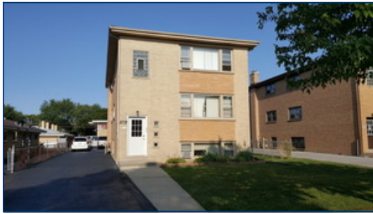
Some photos may be virtually staged

Residential Rental Status: RNTD MLS #: 11152030 Rent Price: $1,550 Area: 101 List Date: 07/10/2021 Orig Rent Price: $1,550 Address: 108 N Church St Unit 2, Addison, IL 60101 List Dt Rec: 07/10/2021 Rented Price: $1,550 Directions: Lake St. to Addison Rd., South to Moreland, West to Church St. at Moreland and Church St. Rented: 08/23/2021 Lst. Mkt. Time: 38 Off Mkt: 08/16/2021 Financing: Contingency: Year Built: 1968 Built B4 78: Yes Curr. Leased: Yes Dimensions: 65X140 # Fireplaces: DuPage Subdivision: Model: # Fireplaces: Corp Limits: Addison Township: Addison Parking: Exterior Space(s) Ext:2 Coordinates: # Spaces: Rooms: 5 Bathrooms (Full/Half): 1/0 Parking Incl. In Price: Bedrooms: 3 Master Bath: None Waterfront: No Basement: None Brnt Bath: No Appx SF: 1400 Total Units: 3 Board Approval: SF Source: Estimated Unit Floor Lvl.: 1 # Days for Bldg. Assess. SF: # Stories: 2 Bd Apprvl: Short Term Lease?: No Avail Furnished?: No Furnished Rate: Short Term Rate: Security Deposit: 1 MO Mobility Score: 43 - Fair Mobility!